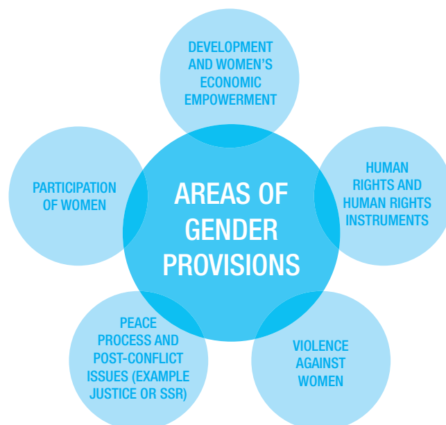
FIGURE 1: BROAD CATEGORIES OF GENDER PROVISIONS

In other cases, the provision acknowledges the unique experiences or impact of conflict on women in ways that are context specific, but again does not provide a concrete approach to address the issue. For example, the 2008 Kenyan National Dialogue and Reconciliation statement promises to "ensure equity and balance are attained in development across all regions including in job creation, poverty reduction, improved income distribution and gender equity." While this is a reasonably strong commitment, the agreement provides no detail on how such a goal will be resourced or achieved.