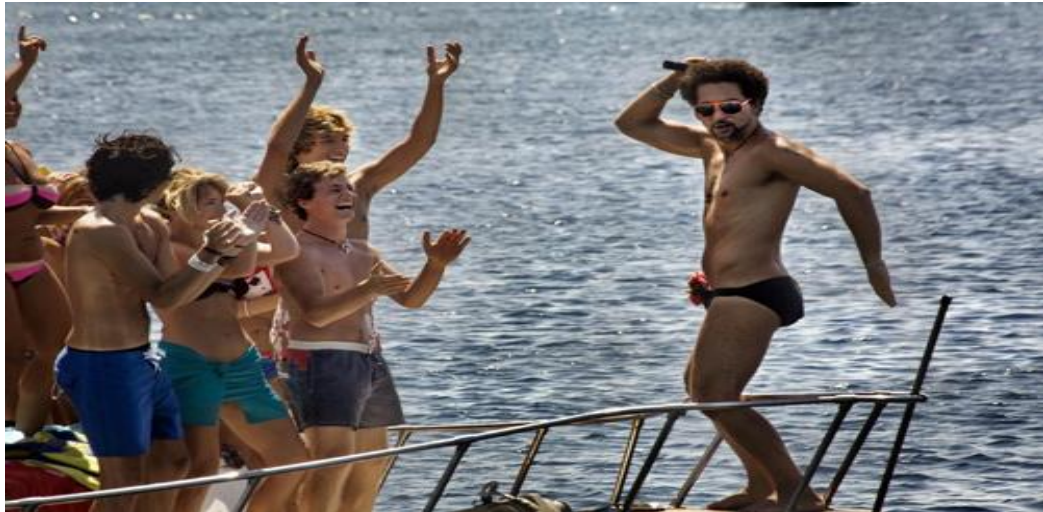
Figure 2: Nino (Giuseppe Fiorello) dances for the tourists in Terraferma (00.54.33)