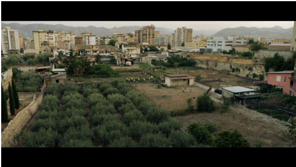
Figure 6: The view from the end of the narrow street in Via Castellana Bandiera (00.35.22)

in order to calm herself when she was angry. The movie thus alludes to the history of the unruly growth of the peripheries of major southern cities like Palermo in the 1960s and 1970s, when the high amount of internal migration from the country and from smaller cities to the major urban centres determined the fast and unsatisfactorily planned creation of new neighbourhoods, which soon fell into urban decay and where a new urban proletariat in dire conditions was located. 330 This explanation serves as an illustration of Rosa's motivations in engaging in the duel with Samira and it bridges the private and the public, the individual and the collective, the centre and the periphery, by inserting the history of internal migration into the core of the individual's concerns. The present degradation of the western periphery of Palermo and the memory of how the place used to be, the sense of a commonality of a shared space, somehow prevents Rosa from letting go of what could be read only as a petty row over street precedence.