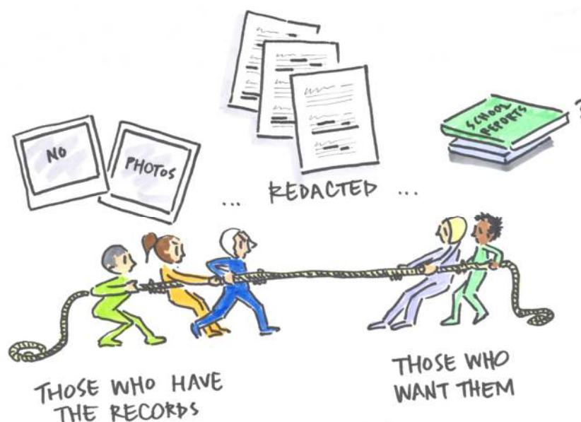
Fig 1 One of the most popular illustrations from the graphic notetaking at the Summit by Matthew Magain from Sketch Group

While current standards for out-of-home care emphasise the need to put the physical, emotional, spiritual and social health and wellbeing of children and young people at the centre of service provision, they are being implemented on recordkeeping infrastructure built for previous eras of child protection and welfare. Current frameworks, processes and systems put the rights of the organisations, institutions and governments providing and responsible for out of home care ahead of those of children and their adult selves. They exclude children and young people from participation in decision-making about their records and continue that exclusion throughout adulthood. The recordkeeping needs of a child-centred model of out of home care cannot just be incrementally added onto existing infrastructure designed for a different age, different values, different principles, and a different technological paradigm.