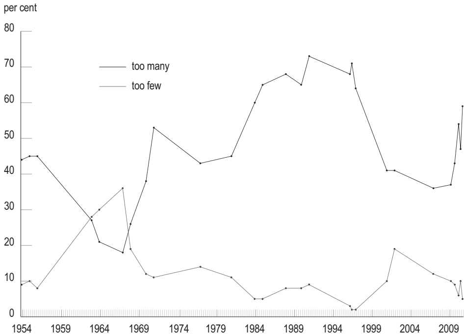
Figure 2: Attitudes to immigration, July 1954 to July 2010

The MGP poll asked respondents to express their attitudes to immigration in terms of their preferred number of migrants. While two numbers were mentioned in the